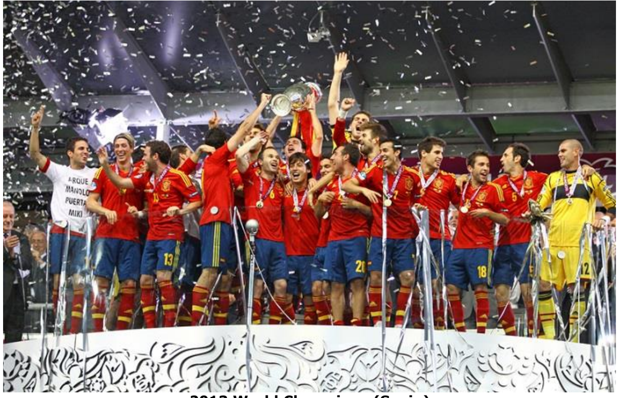
2013 World Champions (Spain)

International Handball Federation is the governing body for various handball tournaments over the globe. In the first championship tournament only four teams participated, but now it has grown to a total membership of 24 teams. As handball gained popularity all over the globe, World Championship was planned and organized by IHF in a duration of every two years for both men and women category, since 1997.